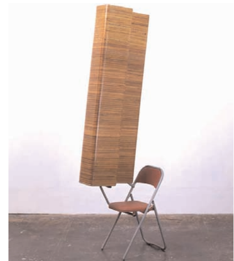
Amikam Toren, Received Wisdom, 2006 © the artist

YSP is an independent art gallery, accredited museum and registered charity number 1067908. YSP receives funding from: Arts Council England, Wakefield MDC, The Henry Moore Foundation and West Yorkshire Grants. www.ysp.co.uk