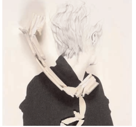
Kate Davis, Partners Study (Figure 1), 2005 © the artist